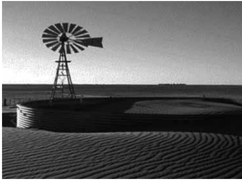
Figure 5. Water storage tank for livestock affected by soil erosion and sand accumulation in abandoned productive farms.

Figura 5. Tanque de almacenamiento de agua para el ganado afectado por la erosión del suelo y la acumulación de arena en predios productivos abandonados.