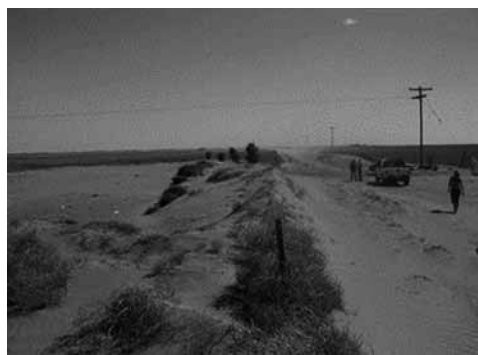
Figure 4. Sand accumulation on fences and wind-blown Salsola kali trapped in them.

Figura 3. Tormenta de arena que afecta la infraestructura vial y el tránsito de vehículos en "La Querencia".