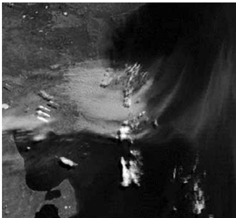
Figure 6. NASA satellite image showing the effects of blasted material transported to the Atlantic Ocean.

Figura 7. Imagen testimonial de la erosión del suelo.