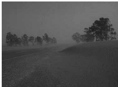
Figure 3. Dust bowl affecting road infrastructure and vehicle transit in "La Querencia".

The latter are desertification indicators and can reach dimensions of up to several meters.