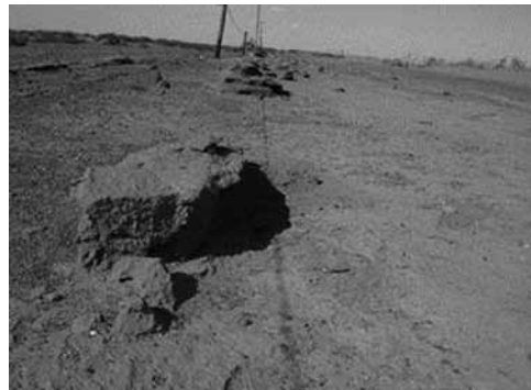
Figure 7. Soil erosion testimonial image.

Figura 5. Tanque de almacenamiento de agua para el ganado afectado por la erosión del suelo y la acumulación de arena en predios productivos abandonados.