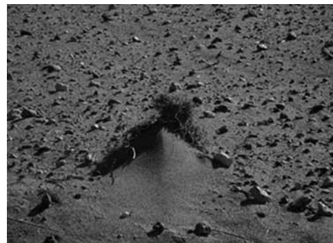
Figure 8. Nebka and desert pavement in formerly productive farms.

Figura 6. Imagen satelital de la NASA que muestra los efectos del material expulsado, transportado al Océano Atlántico.